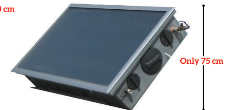
New generation 200L VITASOLAR water heater (Height 75 cm)